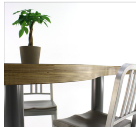
2.25" exposed edge.

Vanerum Studio worked through nine iterations with the designer and end user. As the landscape of the collaboration zone took shape, the furniture adapted to meet aesthetic and budgetary needs as well. The end result was a counter height, two inch thick exposed edge amoeba shape worksurface.